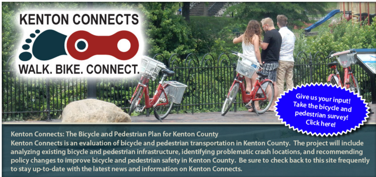
Figure 2: Kenton Connects Survey