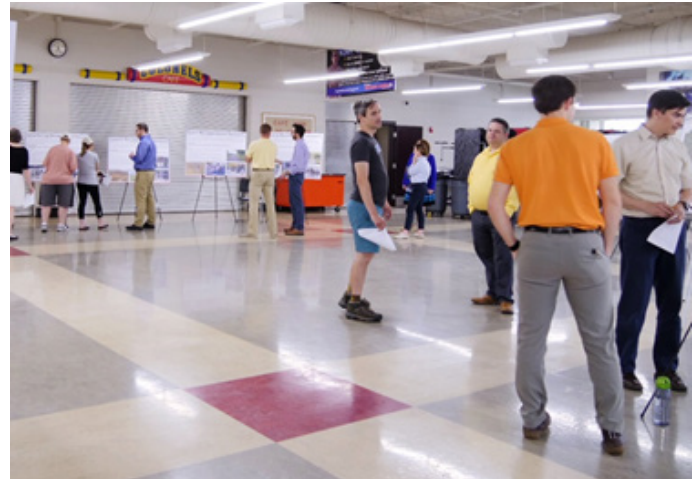
Figure 1: Kenton Connects Public Open House

on the four key recommendation areas: connectivity, safety, education, and usership. Responses concerning the existing conditions research were also included. In total, 22 comment cards were returned.